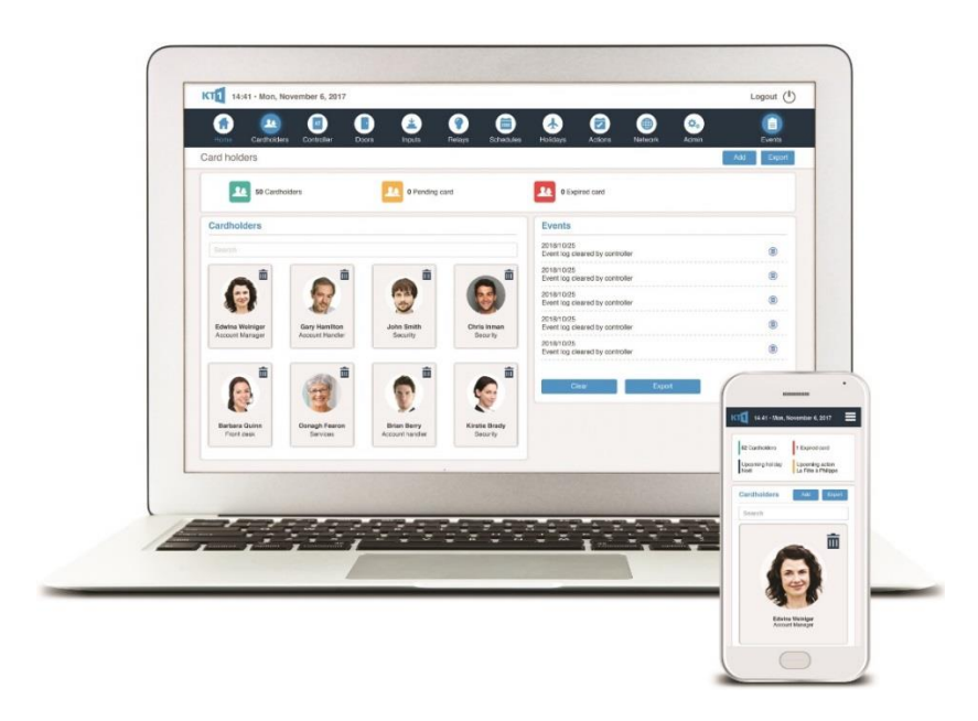
The KT-1 Web software contains many user-friendly features such as the ability to generate and export access control reports for auditing and control purposes.

KT-1 Standalone web based software has been designed to be as intuitive as possible for all your basic security needs. Its responsive design also enables customers to configure and manage their security anywhere and at any time via a desktop or mobile device.