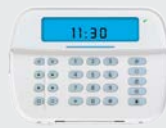
DSC Alarm Panels